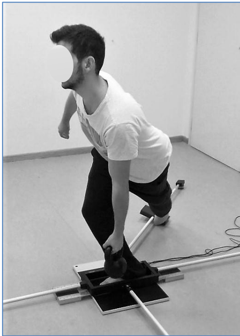
Figure 1. Left-handed A-Level bowler positioning for excursion in posterolateral direction.

1). An aluminum tube was fixed firmly on one of the shorts sides of the frame enabling reaching in P direction. An additional aluminum tube which was placed on the long side of the frame, enable us to position it at an angle of 45° or 90° relative to the posteriorly orientated tube, allowing reaching in PL and L direction, respectively. All tubes were marked in 1-mm increment.